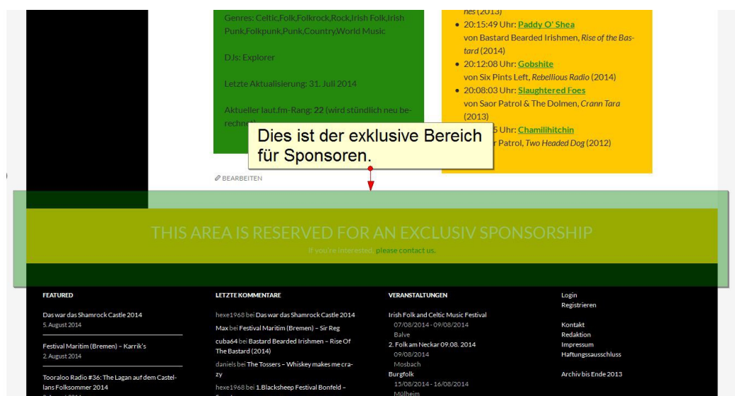
Illustration: This space is exclusively for sponsors.

Fitting this into our website will be done by us and is included if done once for a whole year. For additional 500 EUR + VAT this advert may be swapped within the year.